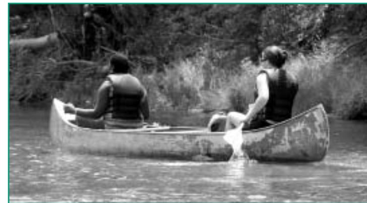
On the River